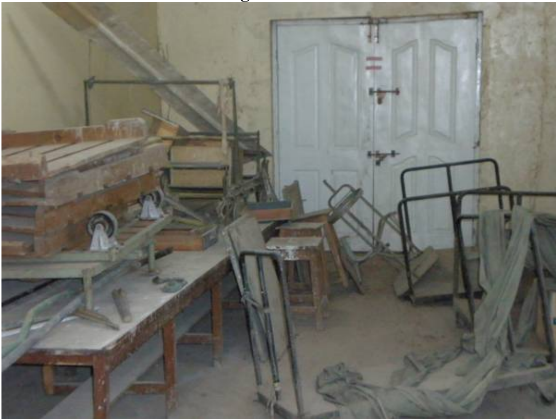
v. Picture of Garment Training Centre Store Condition.