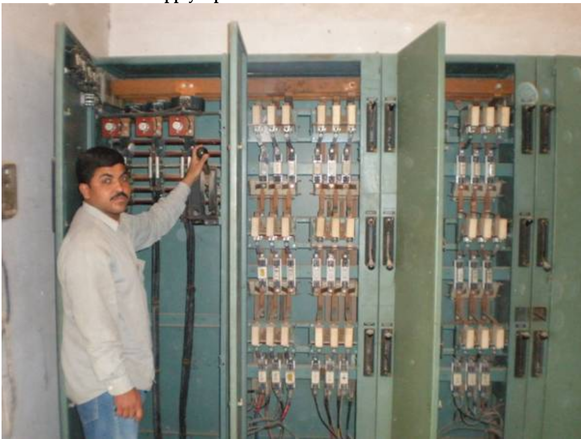
iii. Picture of Power Supply Open Panel Board.