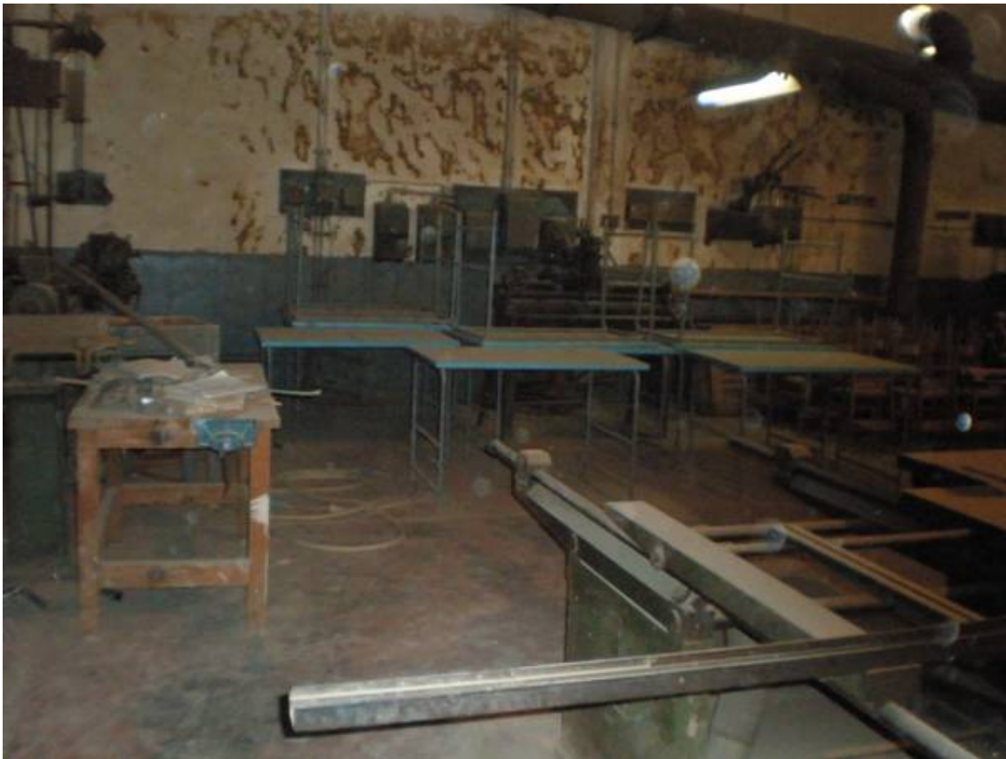
viii. Picture of Production Unit (MT-C).