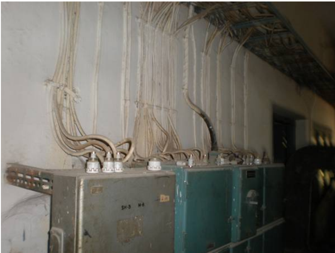
vi. Picture of Machine Shop.