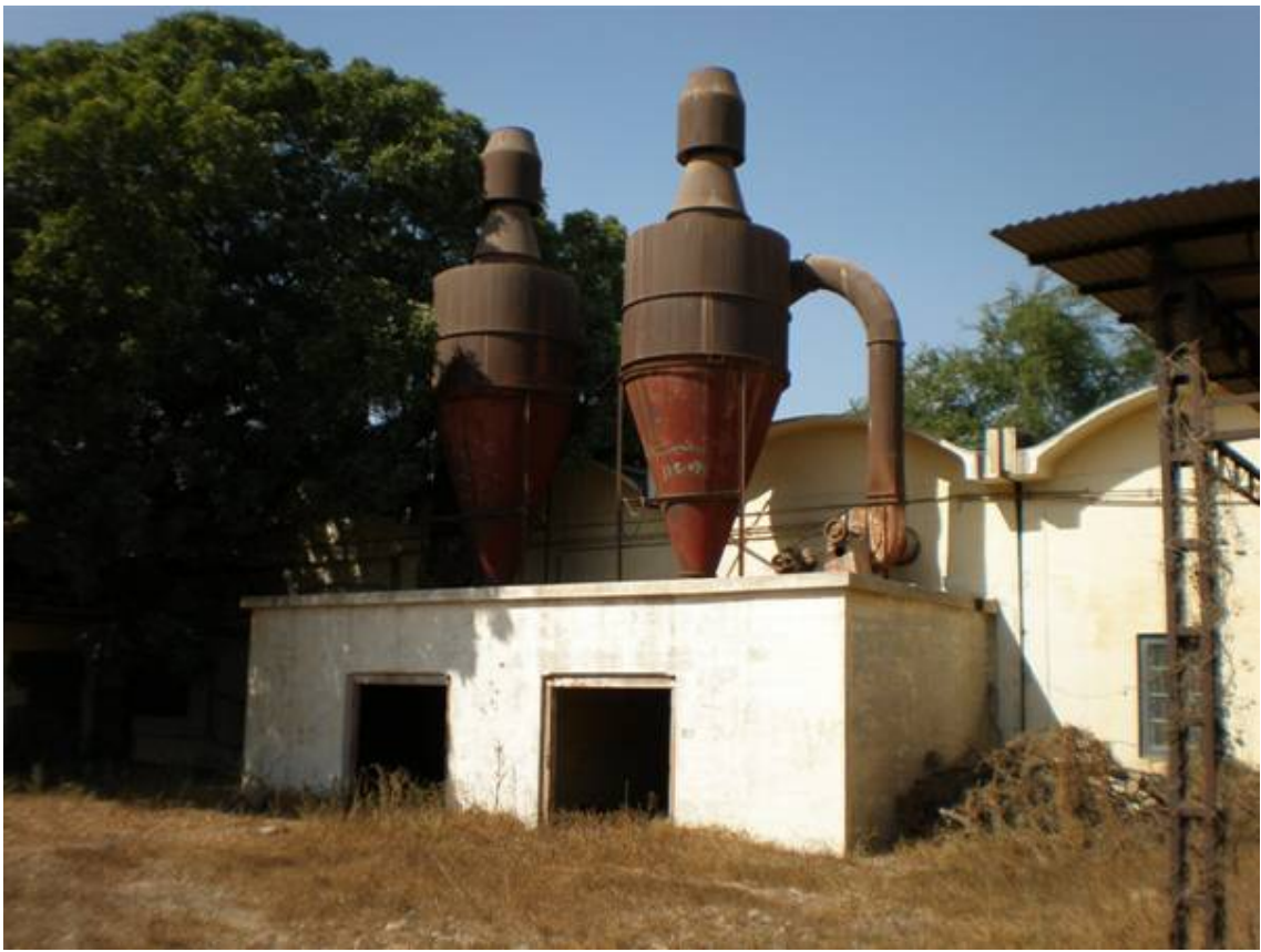
xx. Picture of Production Unit Shade Damage condition.