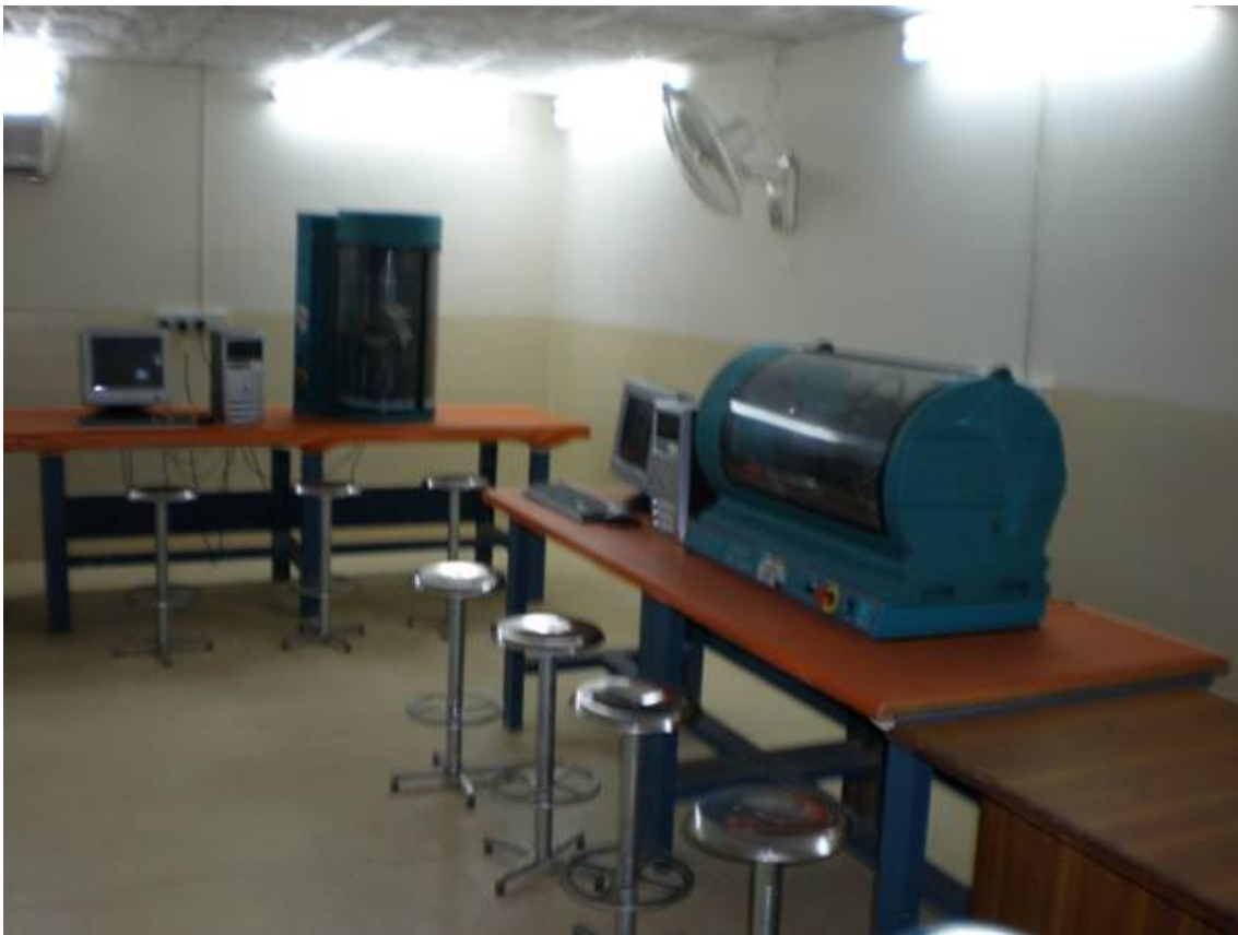
viii. Picture of C.N.C Machine Shop.