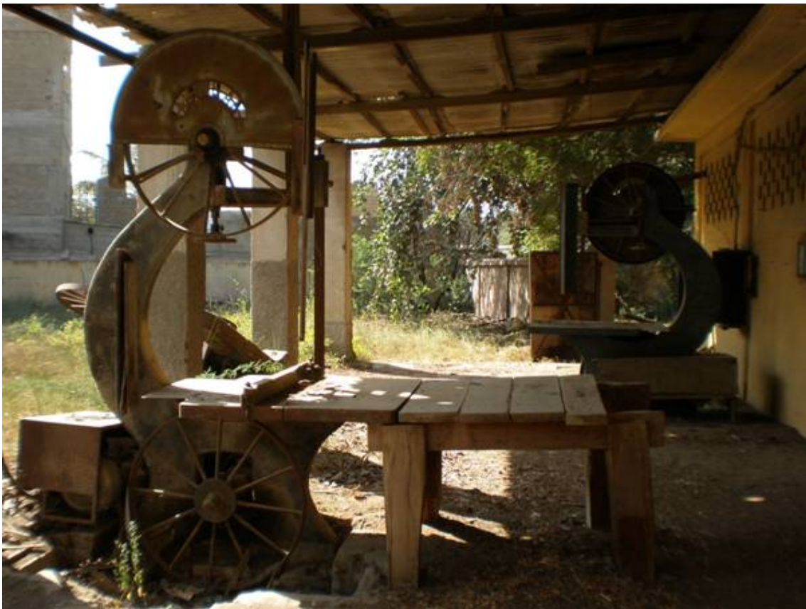
xviii. Picture of Production Unit Machine Damage condition.