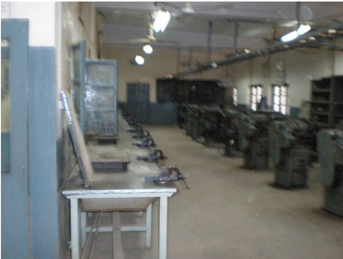
iv. Picture of Machine Shop.