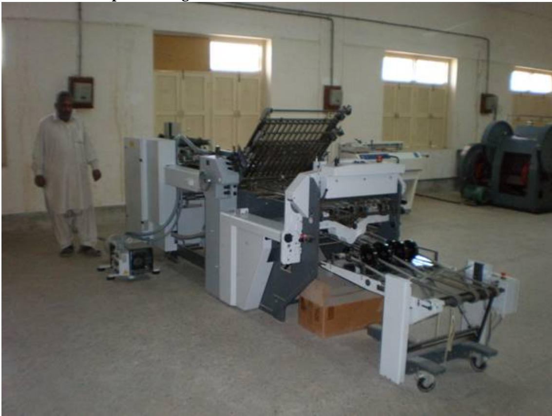
viii. Picture of Binding Machine.