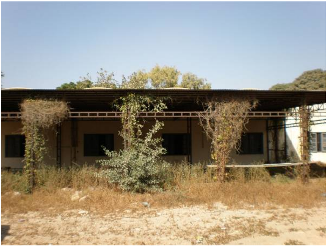
xxii. Picture of Production Unit Power Supply Condition.